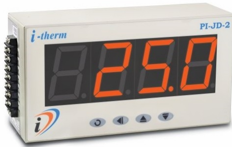
PI-JD-2 (2 Inch)