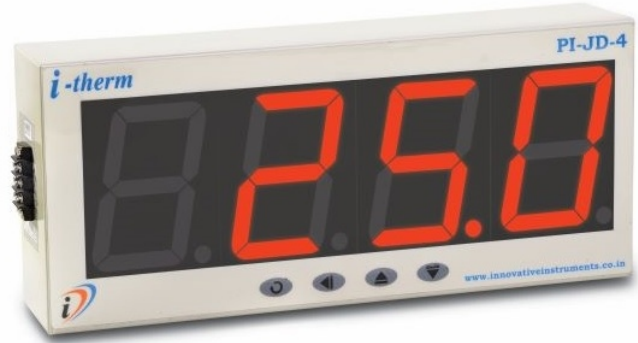
PI-JD-4 (4 Inch)